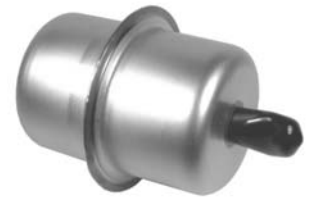
Optional 2 3/4" Conflat Flange Mount