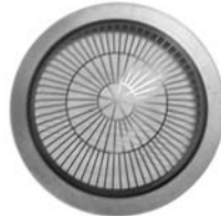
Stocked Molybdenum Etched Mesh (Partial Listing)