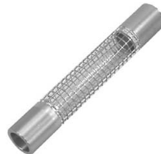
Model 101587 Grid Assembly

Any combination of control grid/ shadow grid can be provided. Grids can be ordered separately or mounted in support structures or as a complete electron gun with integral cathode, heater, focus electrode(s), feedthrus, high voltage standoff, etc. Select from a variety of materials including Molybdenum, Tungsten, Hafnium and Copper. Other exotic materials and coatings are available. Contact HeatWave Labs, Inc. engineering for technical support.