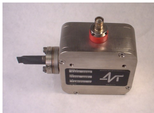
"Space Qualified" Pumps Vibration and Shock Tested Low Stray Magnetic Field