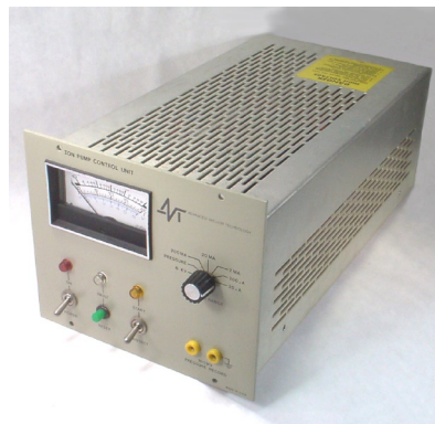
HeatWave Labs Ion Pump Controller