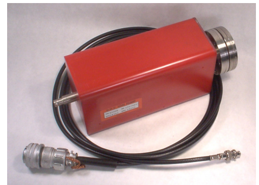
#360027 20 L/Sec Ion Pump with Cable Assy.