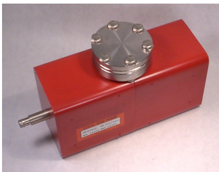
Custom 30 L/Sec Ion Pump