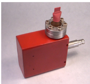
#360021 5 L/Sec