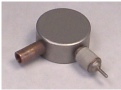
#360038 w/out Mag Assy.