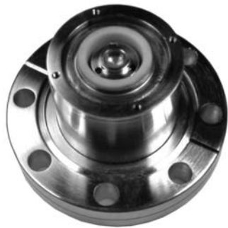
Optional 2 3/4" Conflat Flange Mount

Vg/Vk approximate constant with constant perveance. *Values with optional anode and 0.336 perveance set gap.