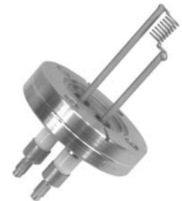
Model 101188 1/4" Dia. Cathode On Typical Flange Mount