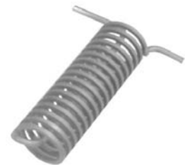
Model 101936, 16 1/2 Turn, 0.5" Dia., Type 31180 Emitter