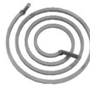
Typical Pancake Emitter