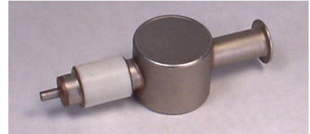
Modified Mini Ion Pump