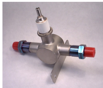
#360006 w/Custom Terminations