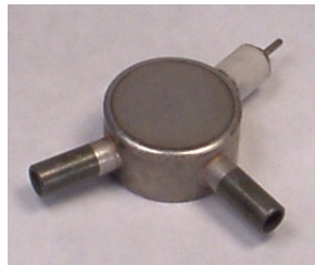
Modified Mini Ion Pump