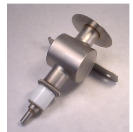
#360049 w/Modified Weld Flange