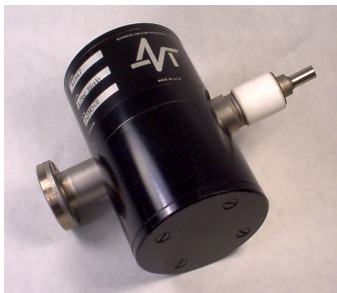
#360001 w/HeatWave Labs Magnet Assy.