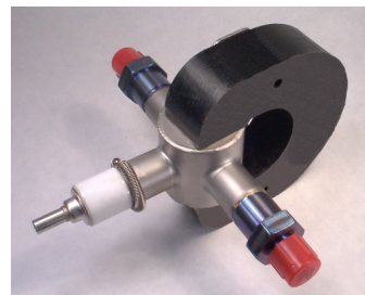
#360006 w/Magnet Assy.